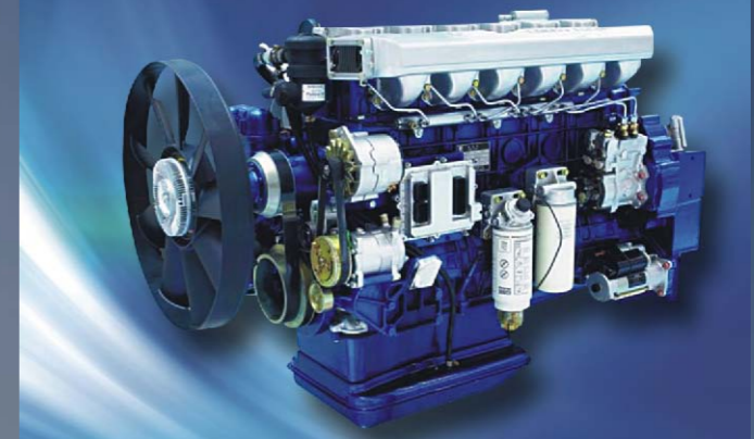
Weichai intelligent and electric fuel injection engine